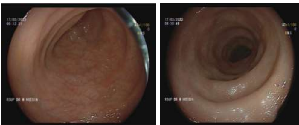
Figure 2. Colonoscopy after antibiotic therapy.

treatment, the metronidazole was stopped and replaced with intravenous meropenem for 6 days, according to the results of the stool culture. Furthermore, the patient underwent an evaluation colonoscopy on the 10th day of treatment, and the results showed that no pseudomembranous plaque was found.